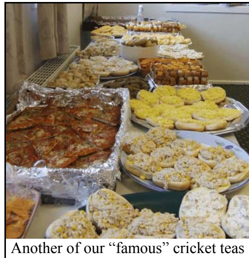
Another of our "famous" cricket teas

Despite the result they all had a fantastic day and enjoyed one of our famous cricket teas. Following on from their great day Bedford's have sponsored the match stumps.