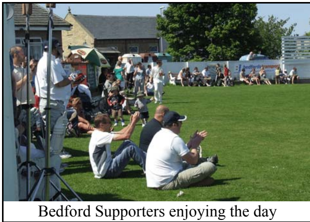
Bedford Supporters enjoying the day

Bedford Transport hired the ground for a corporate day when they challenged the senior team to a match. Despite having the advantage of playing 30 overs to Drighlington's 20 and batting until all their overs were used up they still lost.