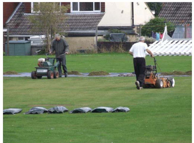
Preparing for next season