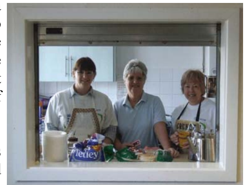
The Support Team